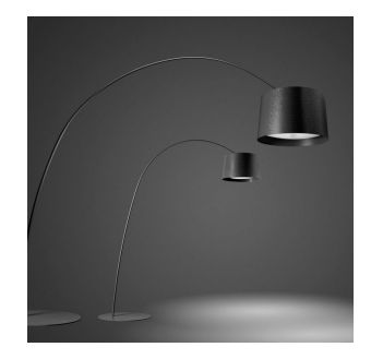
Twice as Twiggy