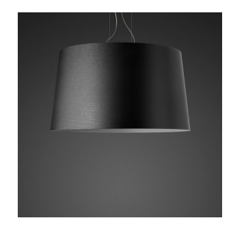
Twice as Twiggy