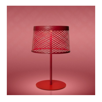
Twiggy Grid XL