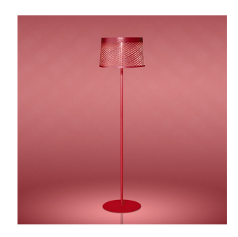
Twiggy Grid Lettura