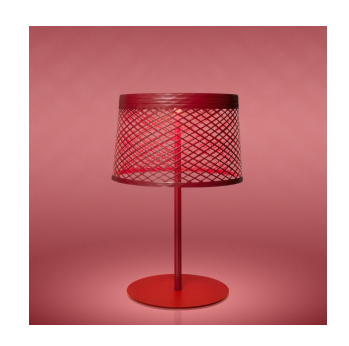
Twiggy Grid XL